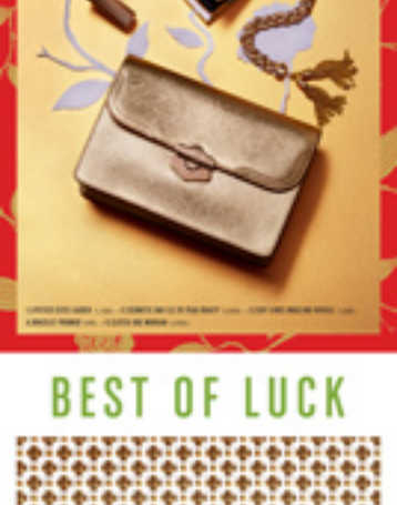
WINTER KNITWEAR LOOK

FOR THE LATEST FASHION TRENDS VISIT WWW.MILLIARDBOUTIQUE.COM OR CALL 02-000-0000. VISIT WWW.MILLIARDBOUTIQUE.COM OR CALL 02-000-0000.