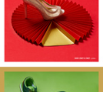
BEST OF LUCK LOOK